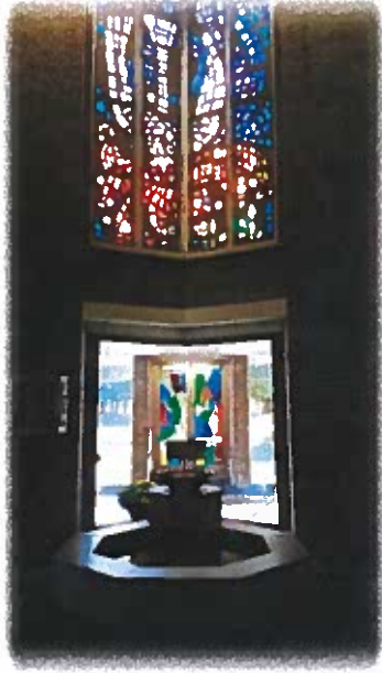
Herman H. Lohmeyer Funeral Home 500 E. Walnut Street Springfield, Missouri 65806